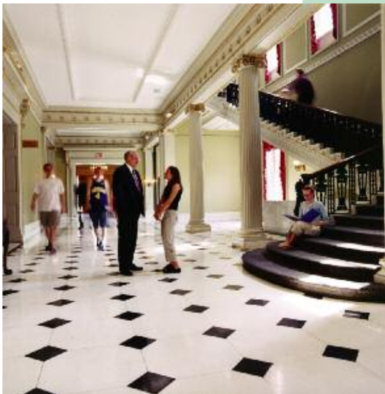
The Great Hall in the Mansion was renovated and parts of the second floor were painted.