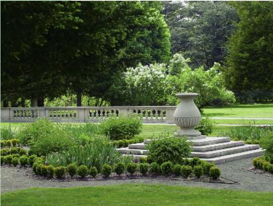
The Italian Garden, to the right of the Mansion, is an excellent example of classic Italian style. New plant material was added and garden structures were restored or replaced.