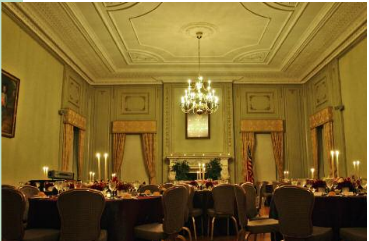
Lenfell Hall, the former drawing room of the mansion, was refurbished in a style reflective of Florence Vanderbilt Twombly's residency.

This project was followed by the restoration of the Italian Garden to the right of the Mansion, which was in particularly poor condition in 1996. The garden, an excellent example of classic Italian style, was built for the Twomblys in the early part of the 20th century by Italian immigrants who then settled in Madison. After consultation with historic landscape architect, Ann Granbery, new plant material was added and garden structures were restored or replaced. The restoration was so authentic that the gardens are now