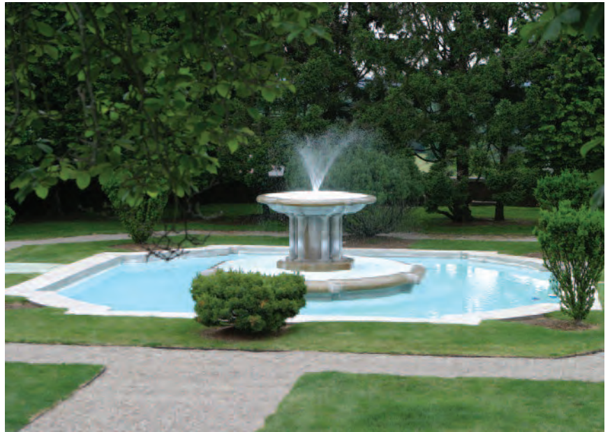
The first project undertaken by the Friends was restoration of the lower fountain garden, which became known as the Clowney Garden.

Since the Friends of Florham was formed in 1990 with the mission of assisting University officials in preserving the historic elements of the College at Florham campus, the total contribution of the Friends to a variety of significant preservation and restoration projects is impressive. The funds were raised at well-attended annual galas, from individual contributions and from foundations' grants. As the Committee looks to undertake new projects at Florham, we thought it was important to reflect briefly on the substantial progress made to date.