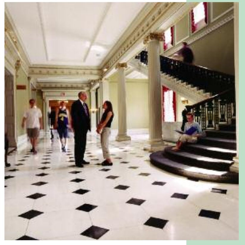
The Great Hall in the Mansion was renovated and parts of the second floor were painted.