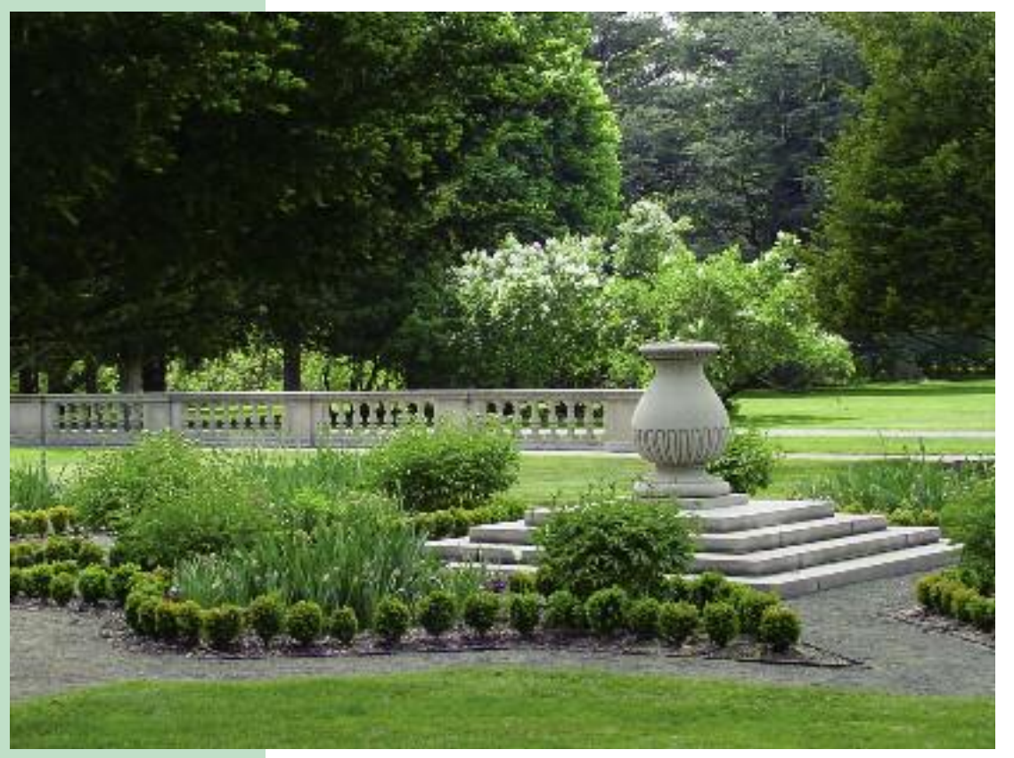
The Italian Garden, to the right of the Mansion, is an excellent example of classic Italian style. New plant material was added and garden structures were restored or replaced.