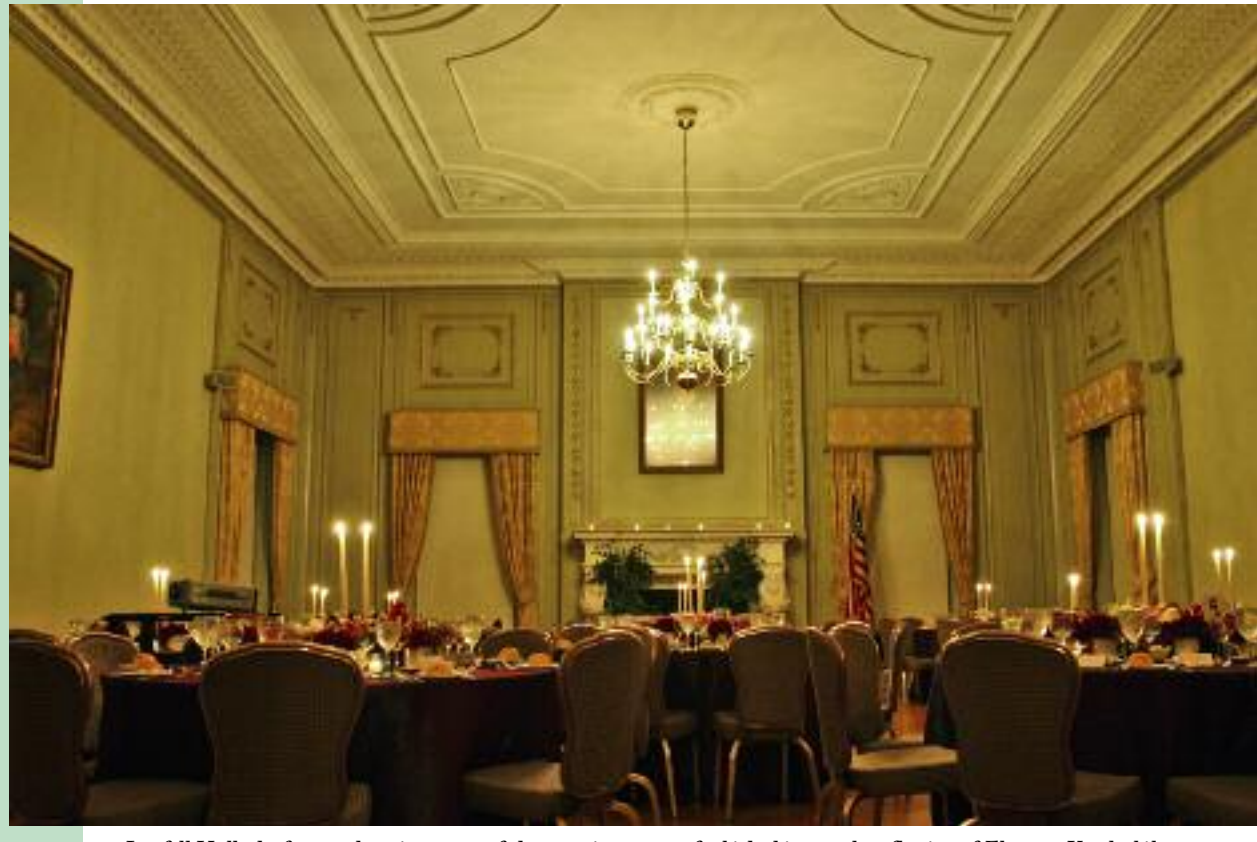
Lenfell Hall, the former drawing room of the mansion, was refurbished in a style reflective of Florence Vanderbilt Twombly's residency.

This project was followed by the restoration of the Italian Garden to the right of the Mansion, which was in particularly poor condition in 1996. The garden, an excellent example of classic Italian style, was built for the Twomblys in the early part of the 20th century by Italian immigrants who then settled in Madison. After consultation with historic landscape architect, Ann Granbery, new plant material was added and garden structures were restored or replaced. The restoration was so authentic that the gardens are now