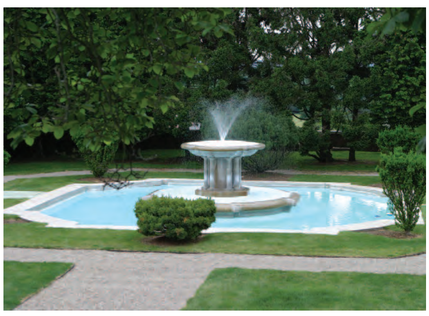
The first project undertaken by the Friends was restoration of the lower fountain garden, which became known as the Clowney Garden.