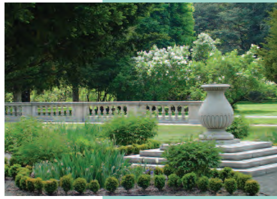
The Italian Gardens located to the right of Hennessy Hall.