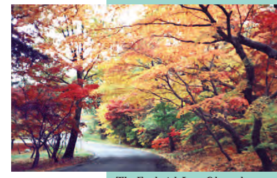
The Frederick Law Olmsted Cutleaf Maple Garden, located on Dreyfuss Road, next to the Rutherford Hall parking lot.