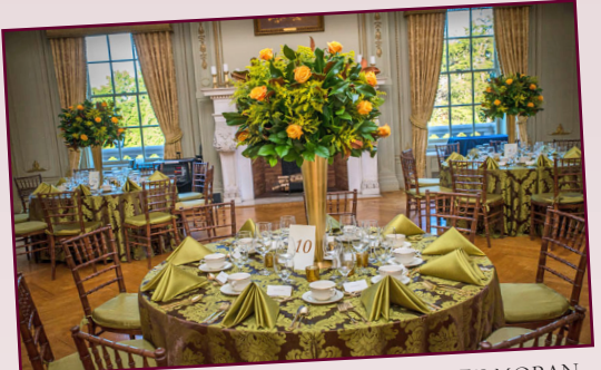
ROOM SETTING BY GALA CO-CHAIR SUZY MORAN