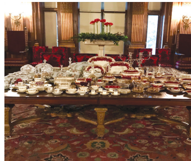
BEAUTIFUL VANDERBILT CHINA