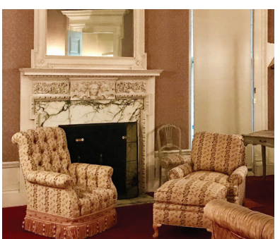
COZY SITTING AREA