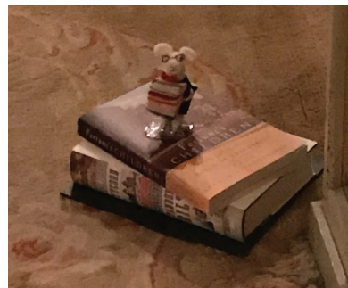
A WELCOMING MOUSE