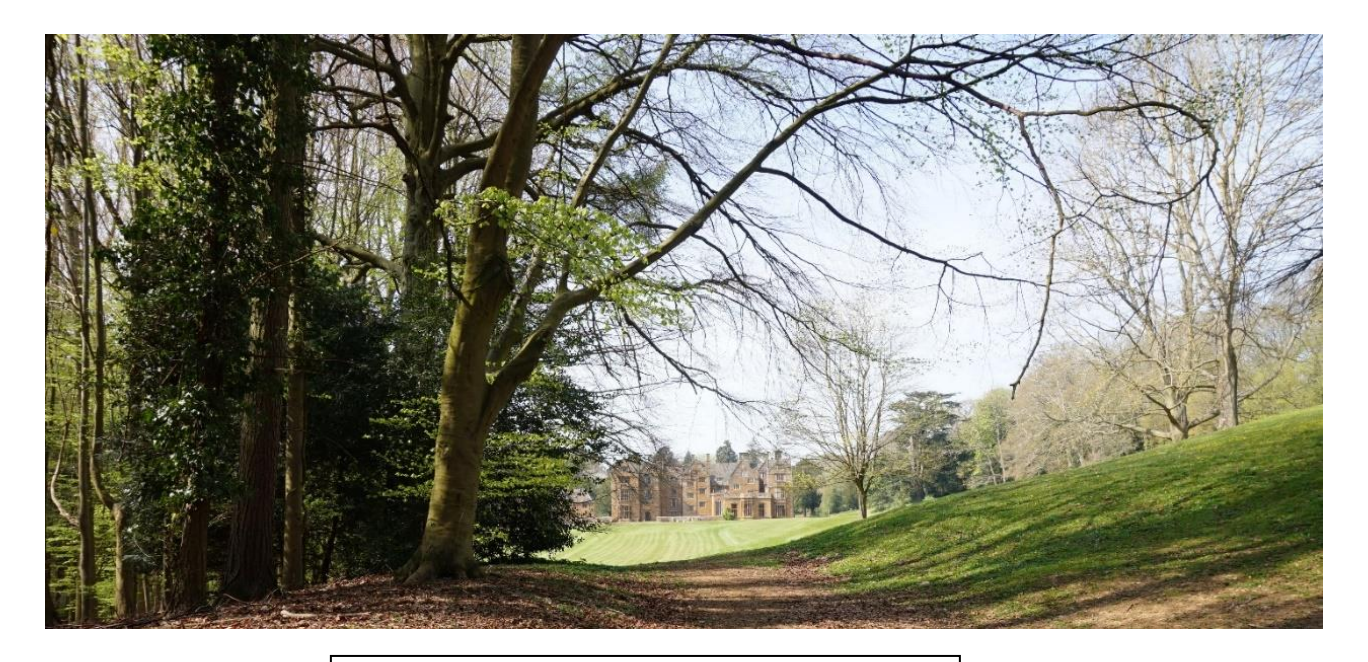
Rear view of Wroxton Abbey, across the gardens