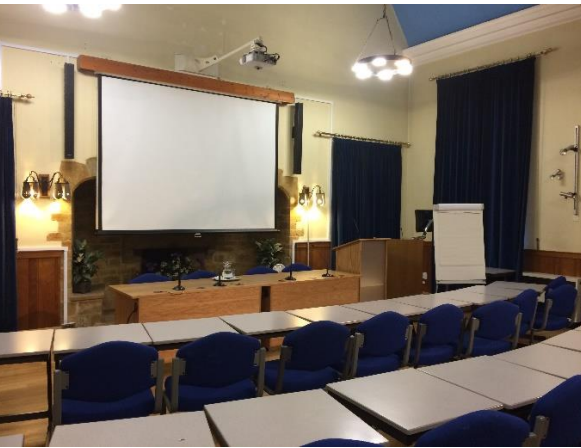
The Regency Room, a spectacular teaching space