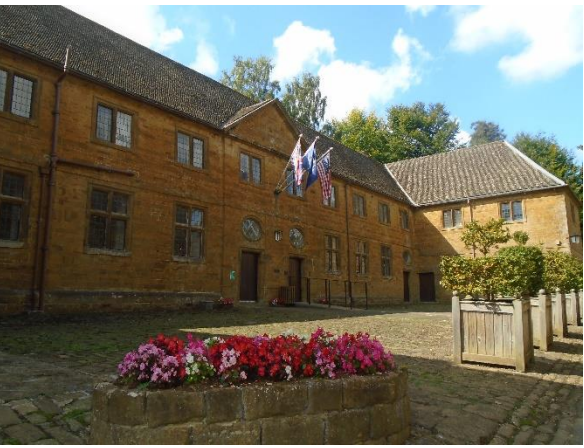
The Carriage House, used for teaching, meals and accommodation