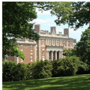
Florham Park, NJ, USA 1958