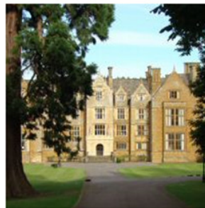
Oxfordshire, England 1965