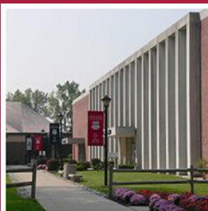
Teaneck, NJ, USA 1942

The Vancouver Campus offers students one of the few opportunities to earn an American college degree while studying in Canada. All degree programs offered at the Vancouver Campus have been authorized by the British Columbia Ministry of Advanced Education. Fairleigh Dickinson University - Vancouver welcomes students from around the world to create a culturally diverse learning environment. Vancouver offers resources to students who need additional support in developing their English-language skills before starting degree studies.