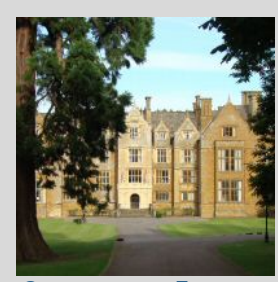
Oxfordshire, England 1965