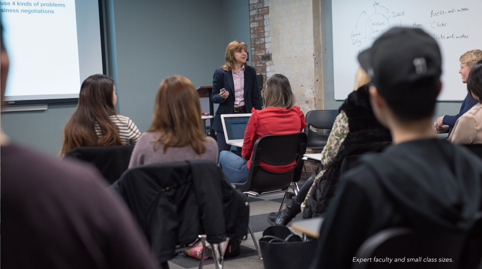
Expert faculty and small class sizes.