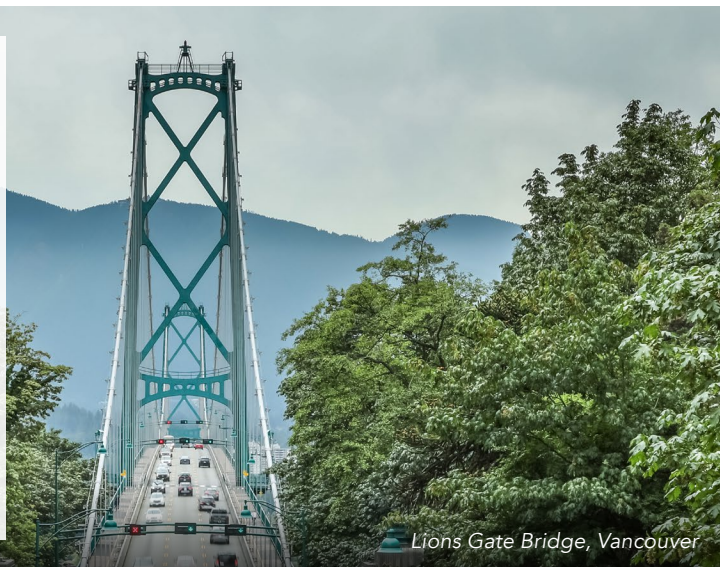
Lions Gate Bridge, Vancouver

Taxi and rideshare services are also available throughout the region.