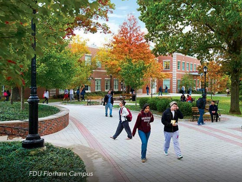
FDU Florham Campus