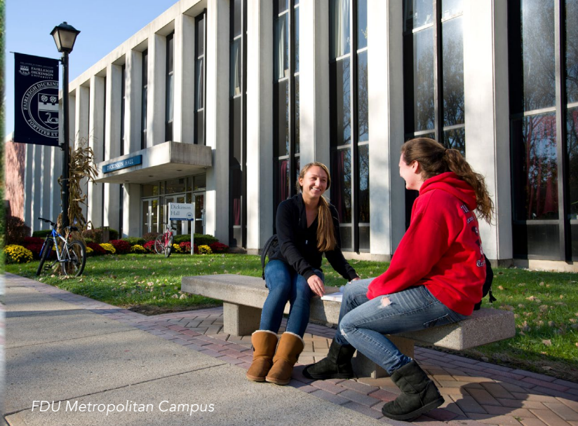
FDU Metropolitan Campus