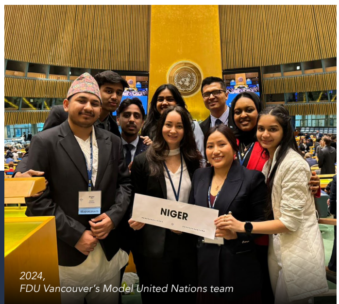
2024, FDU Vancouver's Model United Nations team