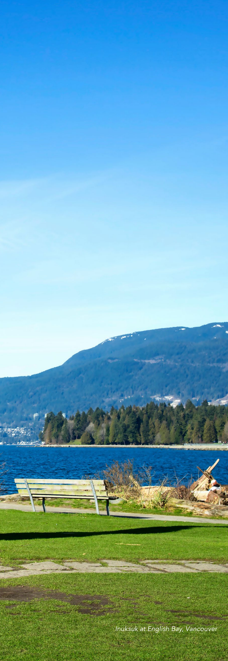
Inuksuk at English Bay, Vancouver